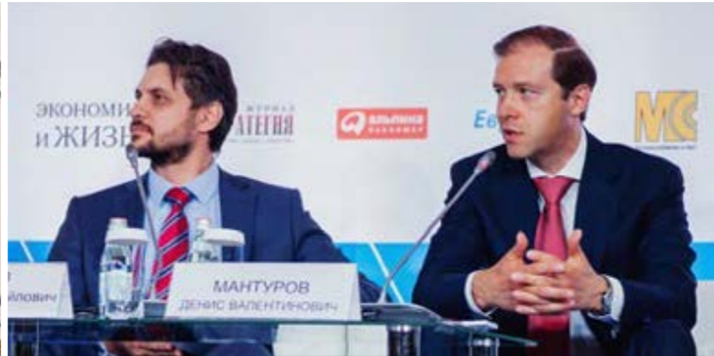
Denis MANTUROV , Minister of industry and Trade of the RF Alexander OSIPOV, First Deputy Minister for development of the Russian Far East , 2014